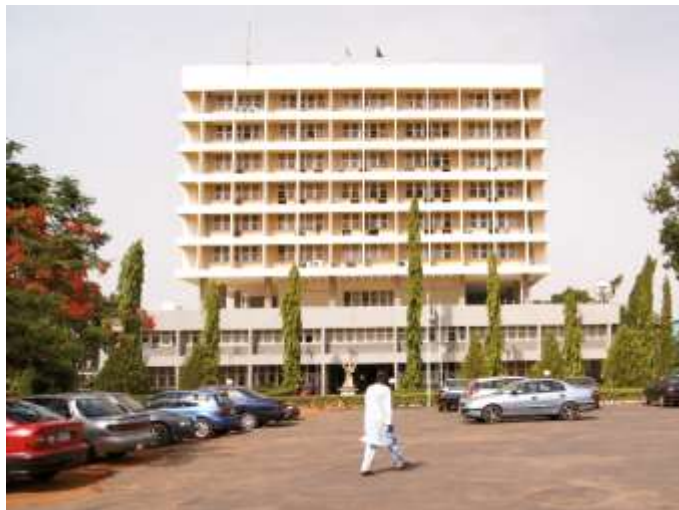
The University Senate building

The academic affairs of the University are managed by the Senate, under which there are Faculty Boards, and a School of Postgraduate Studies Board. There are also Boards of Governors as well as Professional Academic Boards of Institutes and Centres which administer their respective administrative and academic matters.